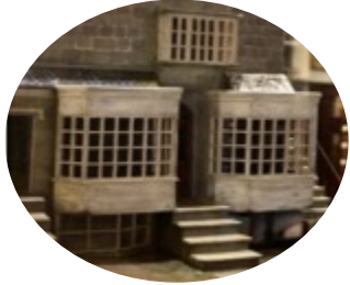
Mary saves enough money to set up her own shop selling fossils