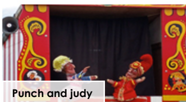
Punch and judy