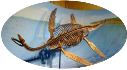
Plesiosaurus 'sea dragon' discovered by Mary