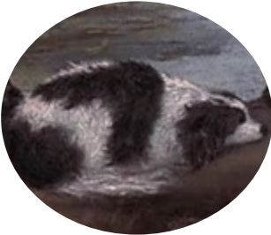
Mary's dog Tray dies during fossil hunt