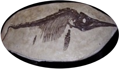
Mary finds first complete Ichthyosaurus with her brother