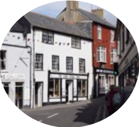
Mary Anning was born in Lyme Regis

You are learning about Mary Anning because she became very famous at a very young age. She was an expert fossil hunter. At a time when most scientists studying fossils were older men, Mary took the world by surprise by the discoveries she made and how much she knew. It took quite a while for people to accept just how much she understood about fossils but eventually she became very well known across the country. She is a great example to young girls interested in science. Even though she was very young and from a poor family with little education, this exceptional woman showed just how much could be achieved in her short life and how much she could teach others.